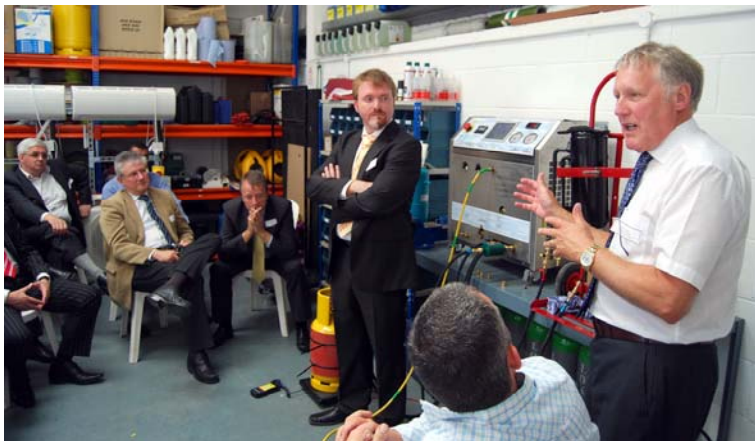
The Fri3Oil system being demonstrated to an audience of 70 leading industry figures at Business Edge's open day and technical conference in July